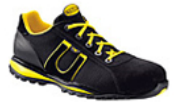
80013 - BLACK