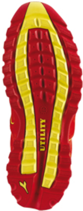
FLARED TO PROVIDE HIGHER COMFORT AND STABILITY