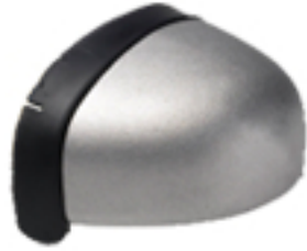
ALUMINIUM TOE CAP 200J