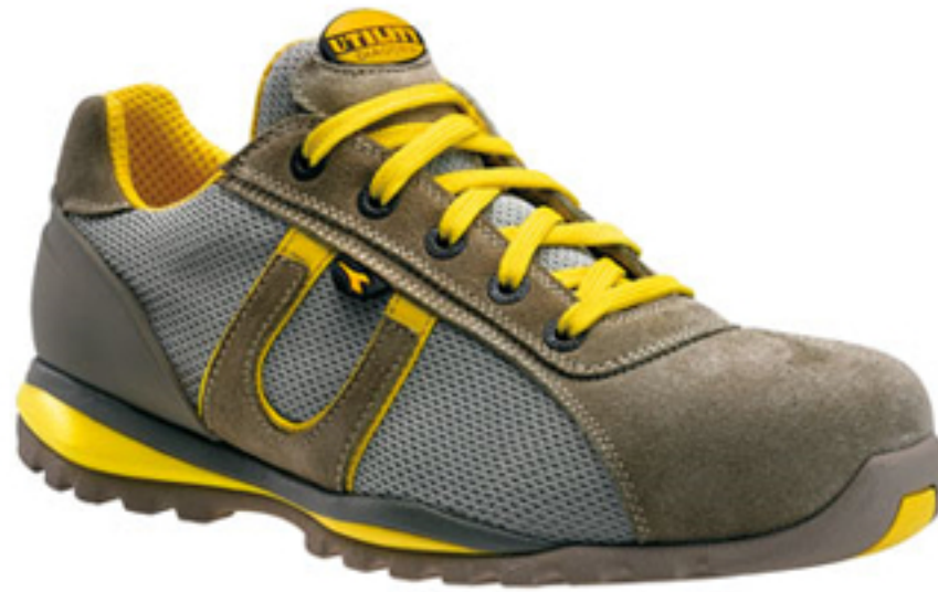
75029 - MOON ROCK