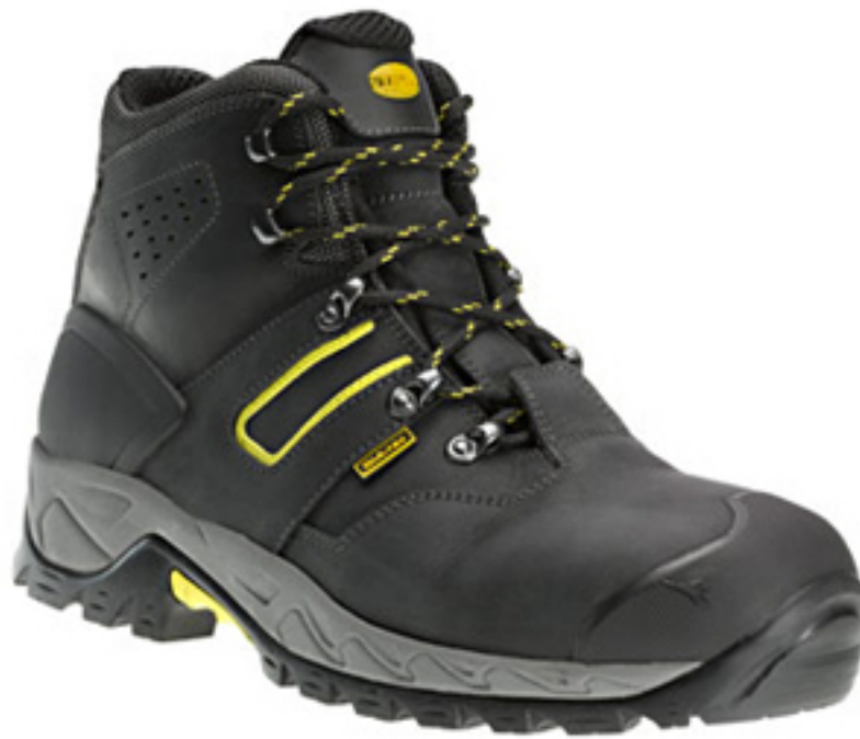
80013 - BLACK