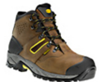
30099 - LEATHER